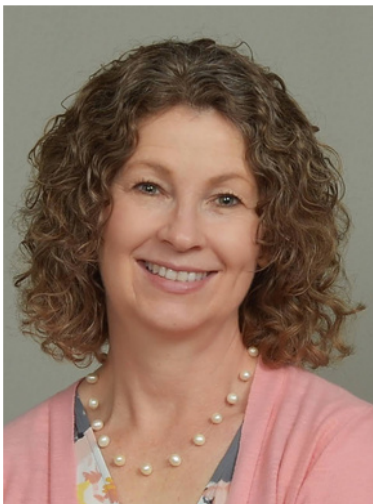
Diana Elder AG ® , AGLTM

Fruitful research begins with a plan. Learn the steps and how to harness the power of thought before action.